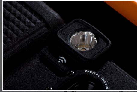
Onboard bright wh With flash and to