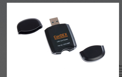
Removable 4Gb memory card USB card reader