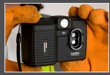
Compact and rugged weighing only

CORDEX INSTRUMENTS LTD. UNIT 1 OWENS ROAD SKIPPERS LANE INDUSTRIAL ESTATE MIDDLESBROUGH TS6 6HE